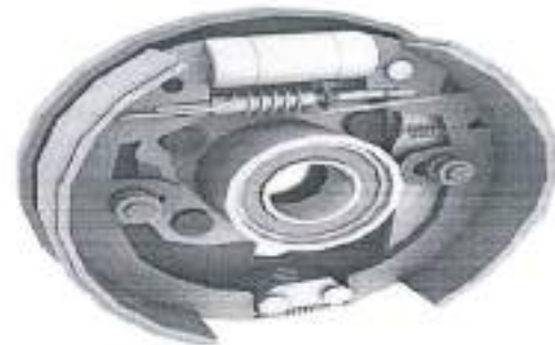
Fig: Drum brake

So in this project we design the model of drum brake (drum, liners, springs etc.) And perform the structural and thermal analysis in solid works premium 2016.