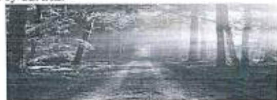
Figure 1: (a): Image

Image contrast is increased by using CLAHE. Instead of the whole image, this technique applies on sub parts of the img, called tiles. By using bilinear interpolation, the neighboring tiles are finally combined in directive to eradicate artificially tempted confines. The enhanced output is displayed in Fig. 4. by CLAHE.