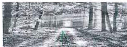
Figure 1: (b): Image enhanced by CLAHE