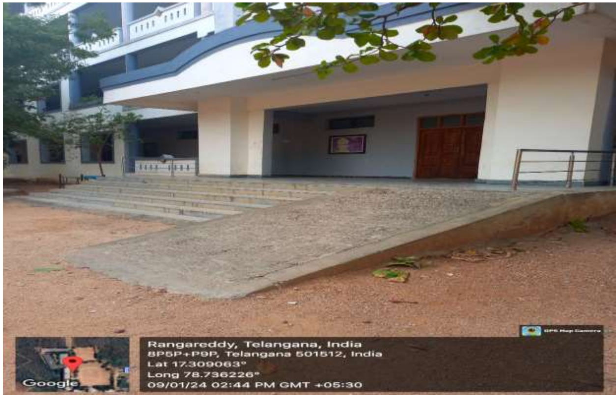
Ramp in B – Block

[Handwritten Signature] PRINCIPAL Annamacharya Institute of Technology & Sciences Piglipur (V), Batasingaram (Post) Adbullapurmet (M), R.R. Dist. HYD-501512