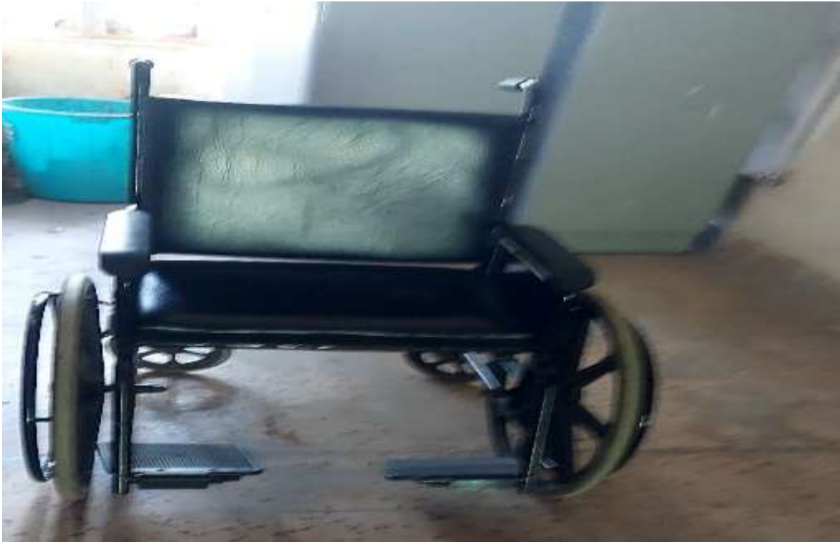
Wheel chair facility at Campus Premises

Piglipur(V), Batasingaram(Post), Adbullapurmet (M), R R Dist., Hyderabad - 501512 (Approved by A.I.C.T.E, Recognized by the Govt. of T.S., Permanent Affiliation from JNTUH, Hyderabad) Accredited by "NAAC with "B+" Grade, Recognized by UGC Under Section 2(f) and 12(B). Website: www. https://aits-hyd.org/ , E-mail : principalaith@gmail.com , Contact No: 9848924705