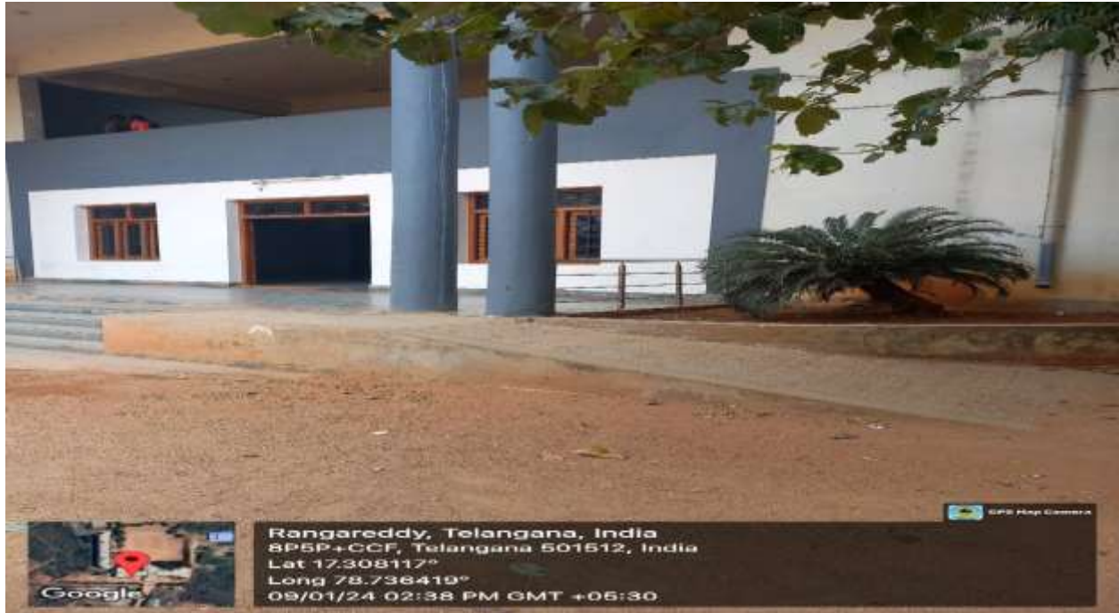
Ramp in A – Block

Piglipur(V), Batasingaram(Post), Adbullapurmet (M), R R Dist., Hyderabad - 501512 (Approved by A.I.C.T.E, Recognized by the Govt. of T.S., Permanent Affiliation from JNTUH, Hyderabad) Accredited by "NAAC with "B+" Grade, Recognized by UGC Under Section 2(f) and 12(B). Website: www. https://aits-hyd.org/ , E-mail : principalait@gmail.com , Contact No: 9848924705